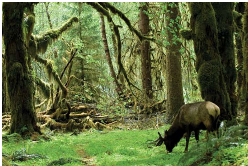
Olympic National Park, Washington