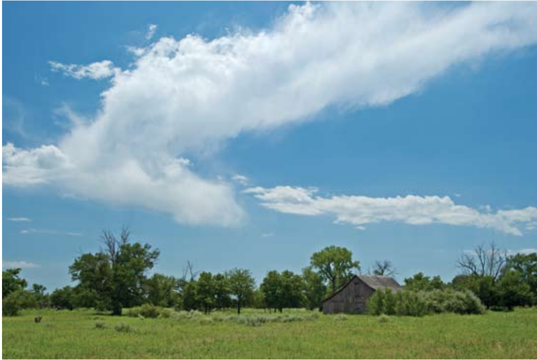
An old Texas farm