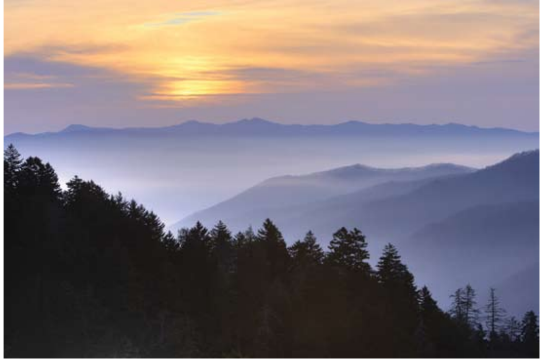
The Great Smoky Mountains