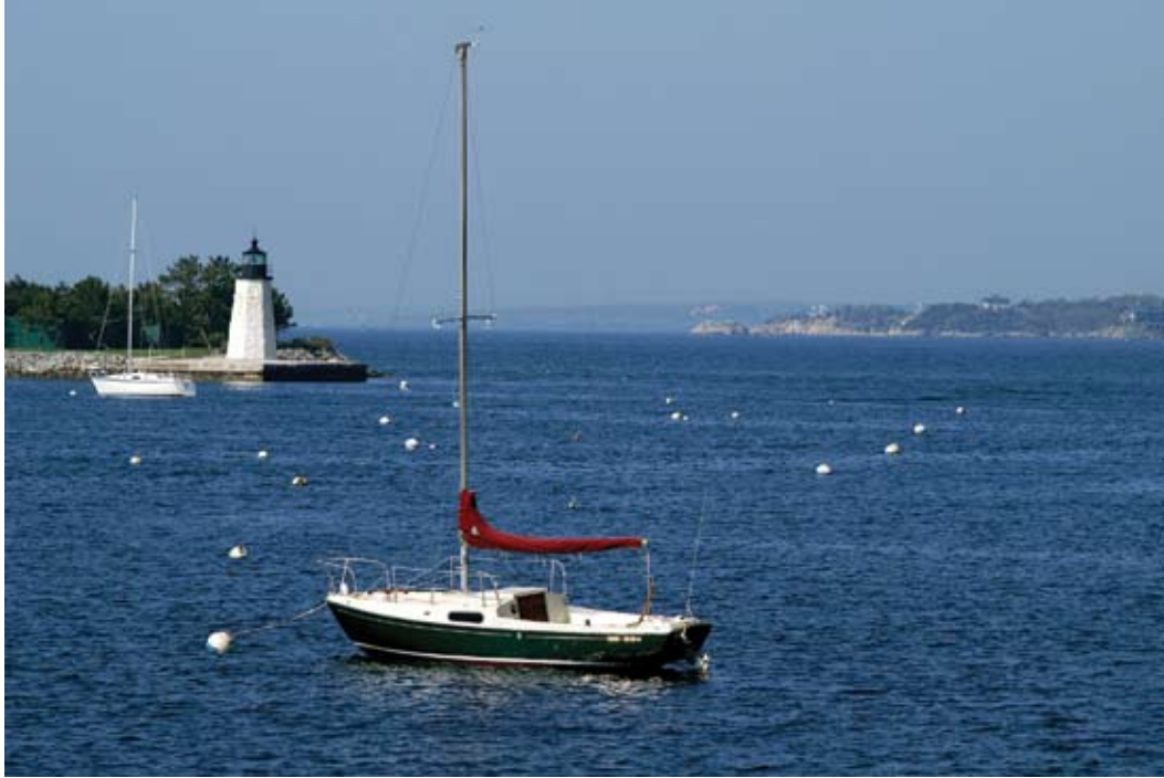
The coast of Newport, Rhode Island