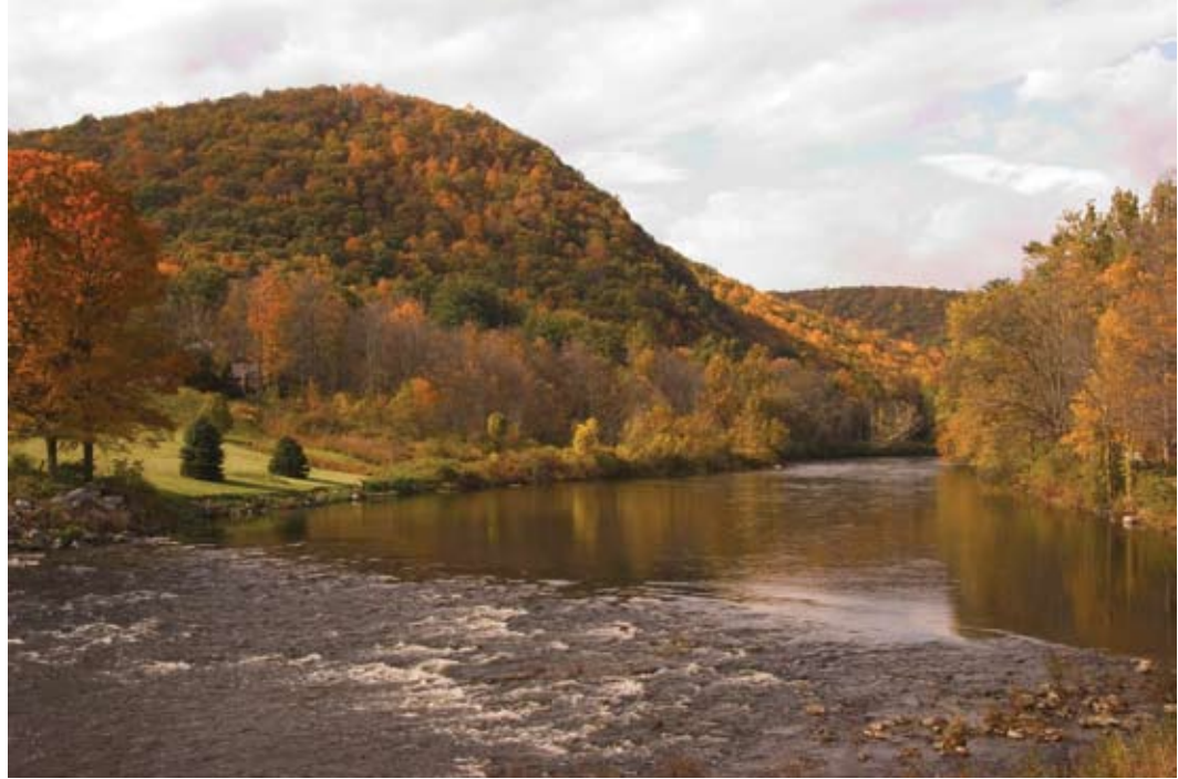
Connecticut's Housatonic River Valley