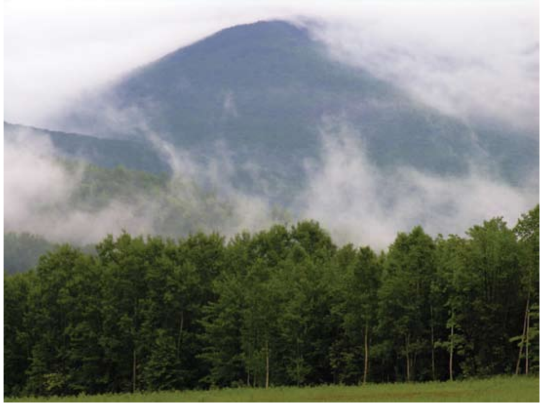
The forests and mountains of northern New Hampshire