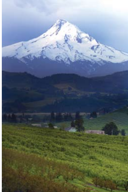
Oregon's Mount Hood

Oregon has used a combination of aggressive land-use planning and purchases of vulnerable and important natural lands to preserve its unique character. Oregon's primary means of funding land preservation is through a dedicated share of state lottery revenue. In the Portland region, which includes one of every three Oregonians, residents have also supported two bond initiatives that have funded protection of critical natural areas.