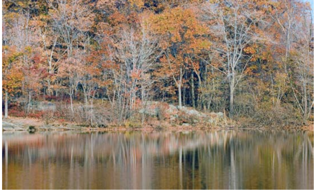
Fall in the New Jersey Highlands