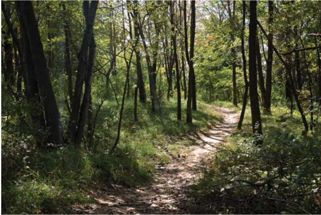
Silver Lake Park, Illinois