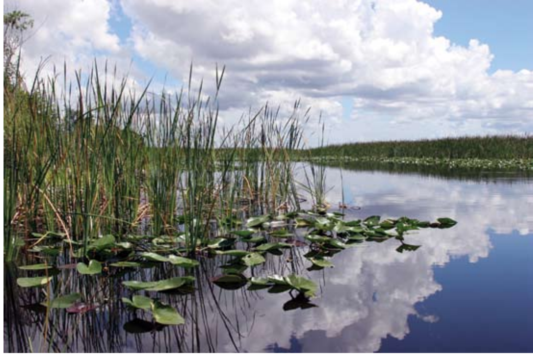
Florida's Everglades National Park