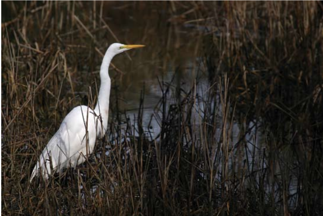
An egret in marshland.