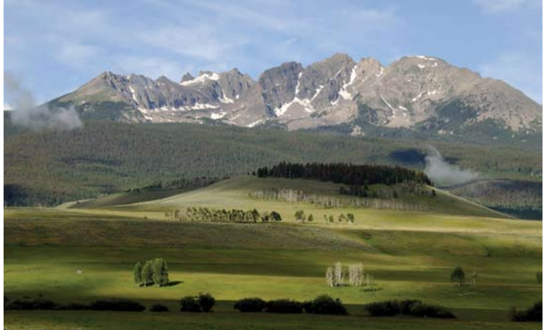
The Colorado Rockies