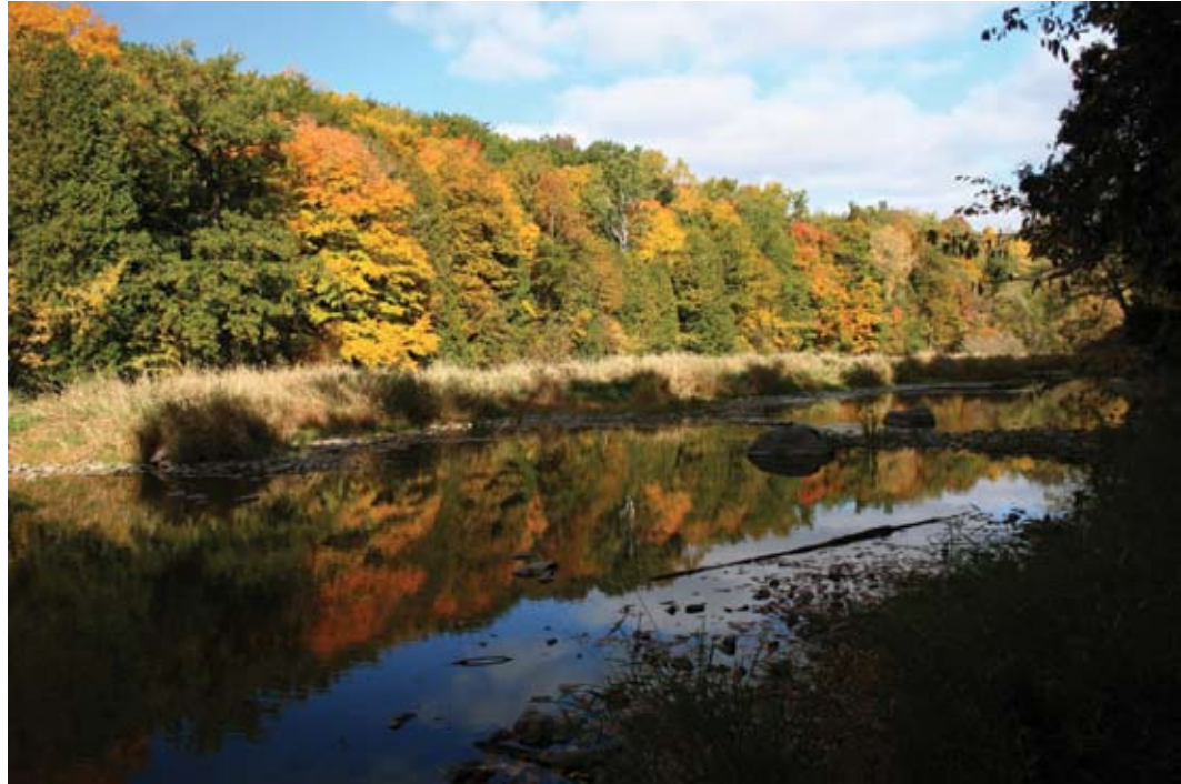
A Wisconsin river in fall