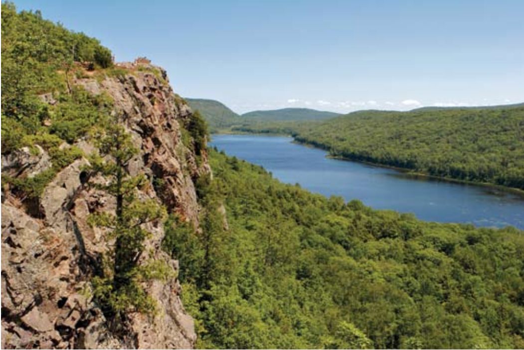
The Porcupine Mountains in Michigan's Upper Peninsula