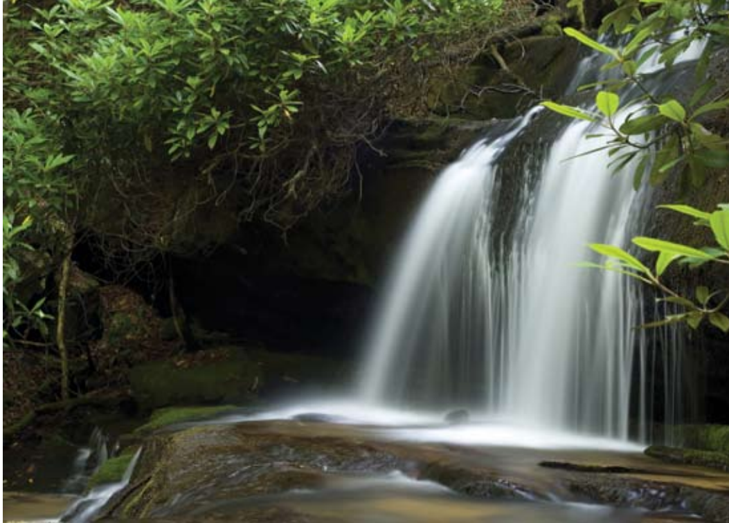
Georgia's Chattahoochee National Forest